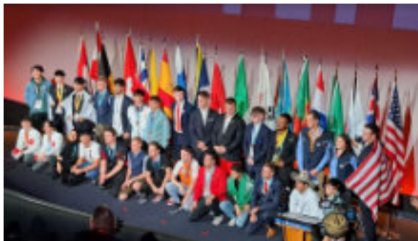
Expert ( National Coach)