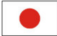
Japan Gold Medal