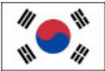
Korea Gold Medal