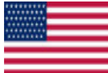
USA Bronze Medal